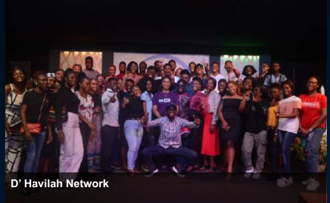
D' Havilah Network