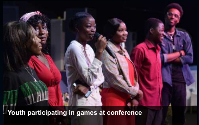
Youth participating in games at conference