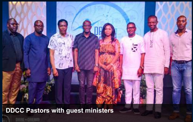
DDCC Pastors with guest ministers