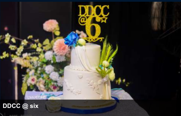
DDCC @ six