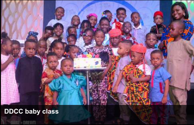
DDCC baby class