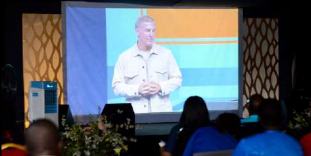
An ongoing session at GLS 2023