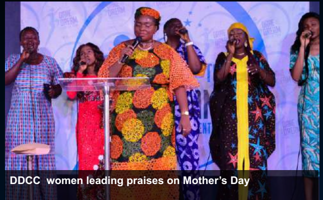
DDCC women leading praises on Mother's Day