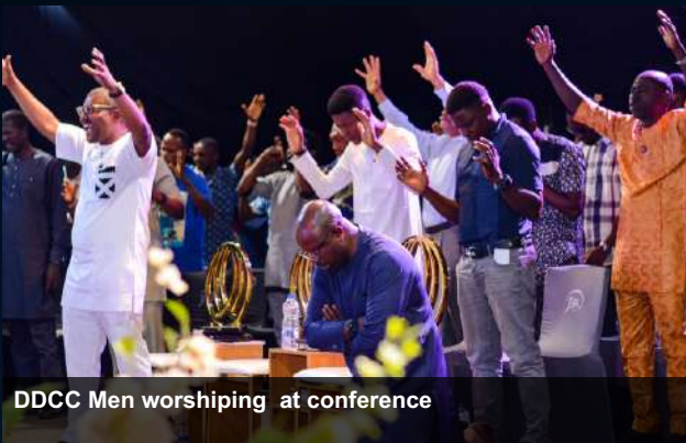
DDCC Men worshipping at conference