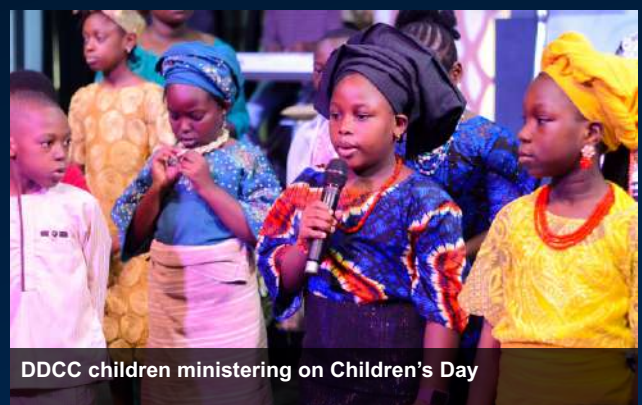
DDCC children ministering on Children's Day