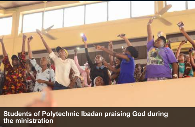
Students of Polytechnic Ibadan praising God during the ministration