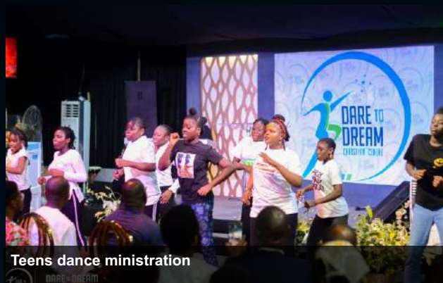
Teens dance ministration