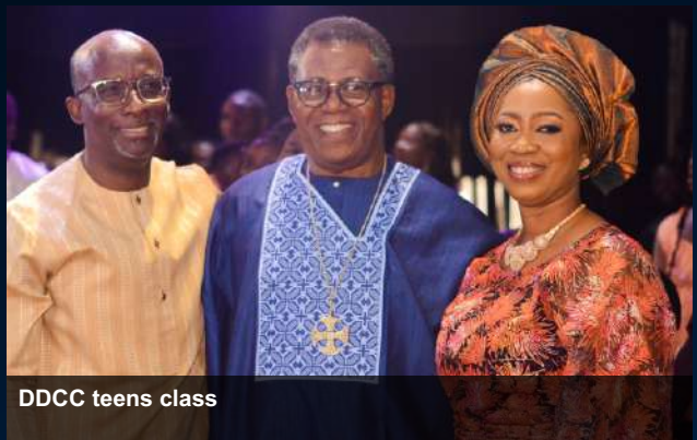
DDCC teens class