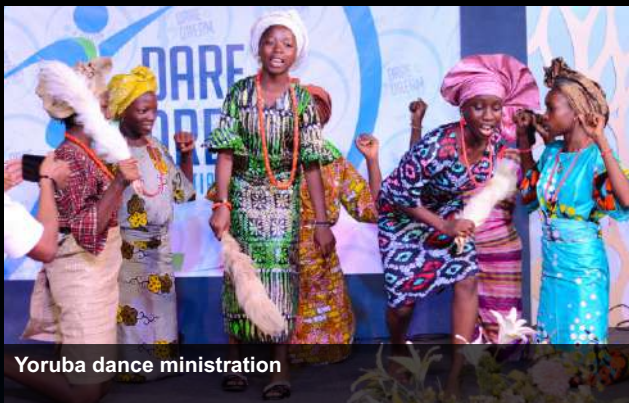
Yoruba dance ministration