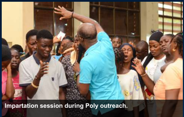
Impartation session during Poly outreach.