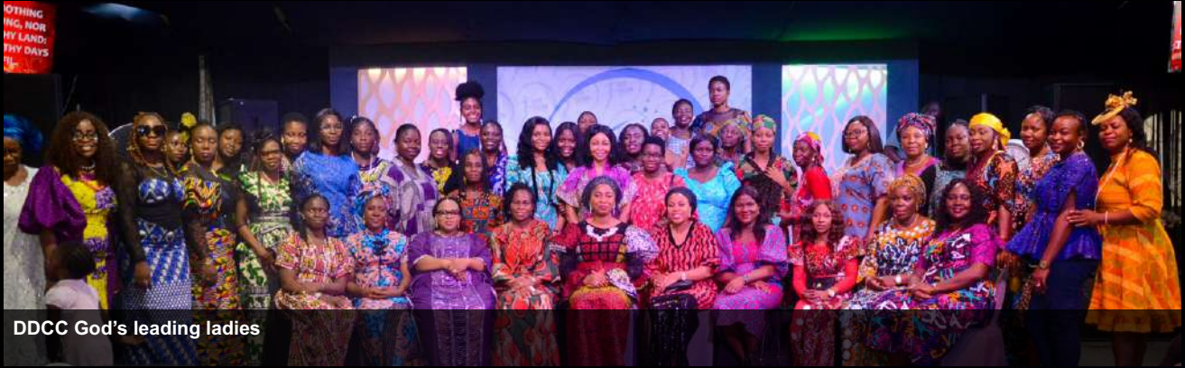
DDCC God's leading ladies