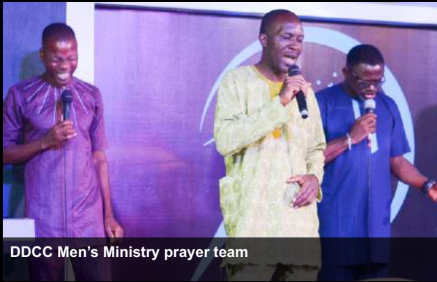
DDCC Men's Ministry prayer team