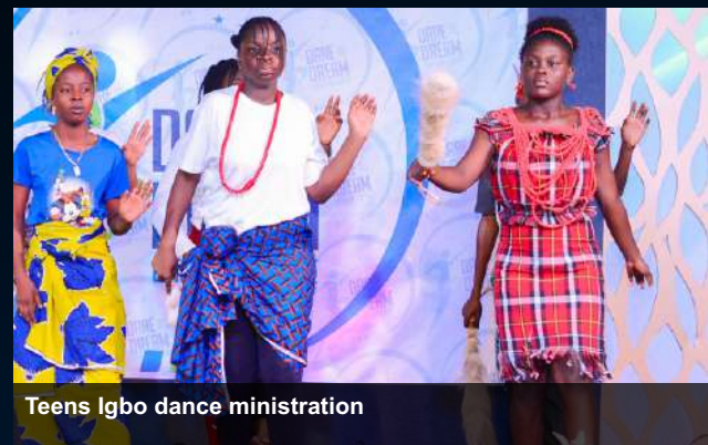
Teens Igbo dance ministration