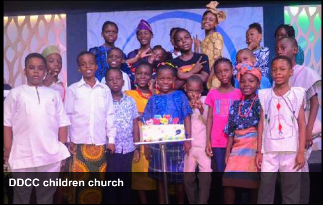
DDCC children church