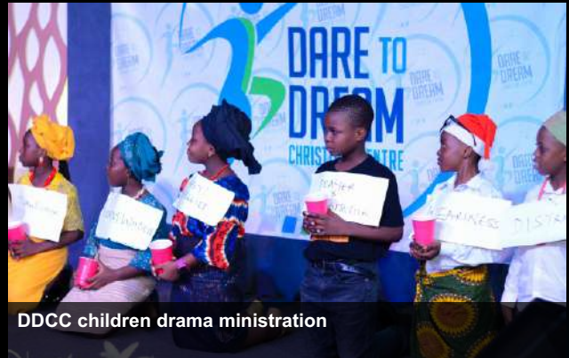
DDCC children drama ministration