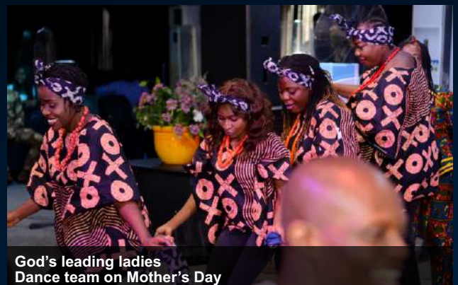
God's leading ladies Dance team on Mother's Day