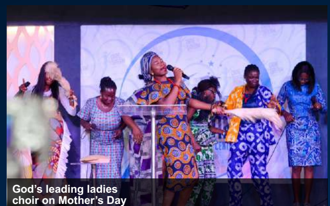
God's leading ladies choir on Mother's Day