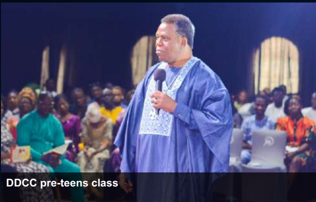
DDCC pre-teens class