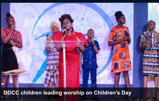
DDCC children leading worship on Children's Day