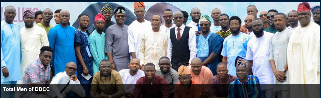
Total Men of DDCC