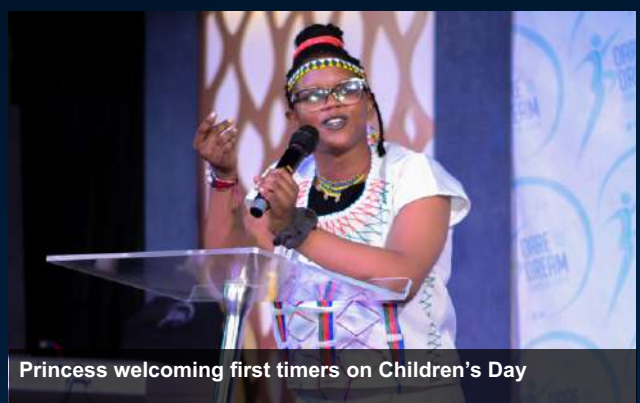
Princess welcoming first timers on Children's Day