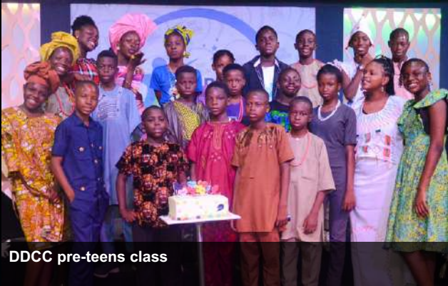
DDCC pre-teens class