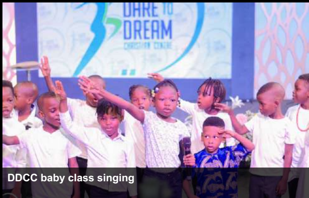
DDCC baby class singing