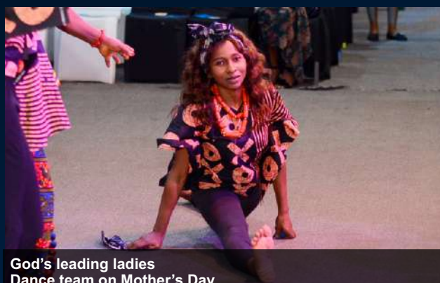
God's leading ladies Dance team on Mother's Day