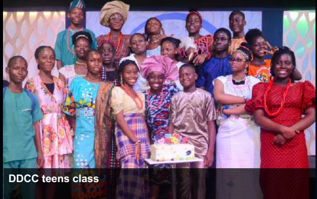
DDCC teens class