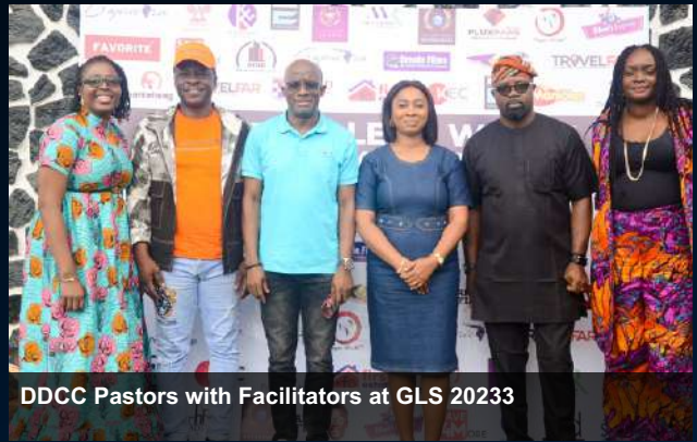
DDCC Pastors with Facilitators at GLS 2023