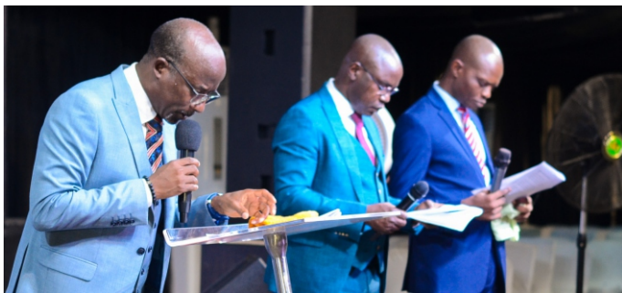
Pastors taking their pledge