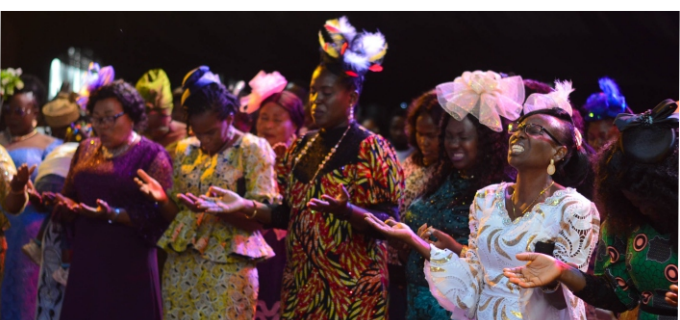
Cross section of women on Mother's Day