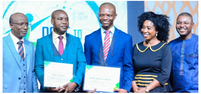
New Pastors with the lead pastors