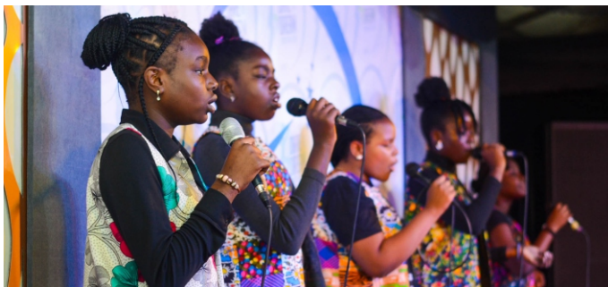
DCC teens ministering on Children's Day