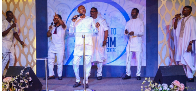
DDCC Men Choir ministering on Father's Day