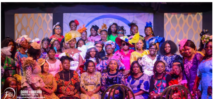
DDCC Women's Ministry (God's Leading Ladies)