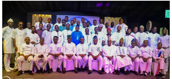
DDCC Men's Ministry