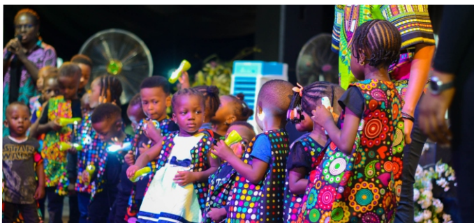
Baby class ministering