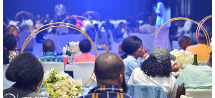
Cross section of attendees at the Praise Party