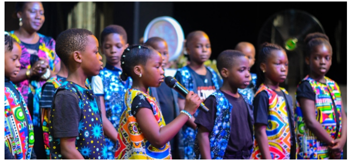
Preteens class ministering