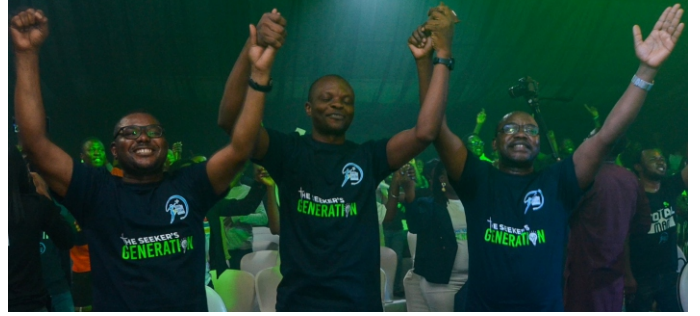
DDCC Ministers celebrating at the 5th gratitude concert