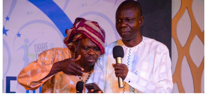
Men during a drama ministration