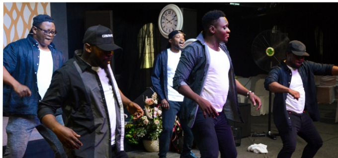
Men presenting a dance ministration