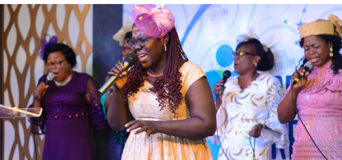
Women's ministry choir ministering