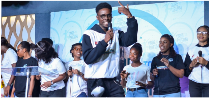
D' Havilah Choir ministering