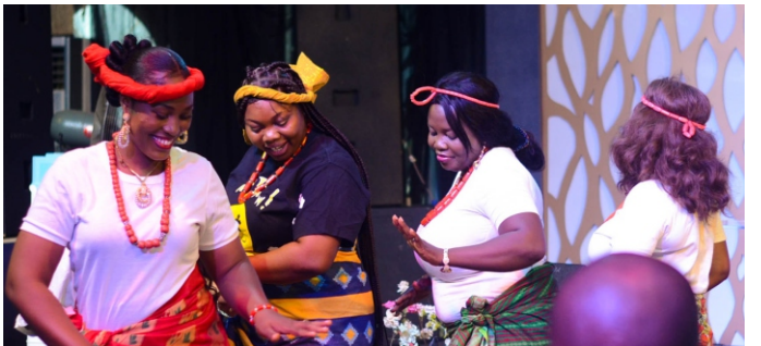
DDCC women during dance ministration